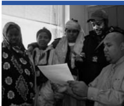
A group of Somali Bantu refugees learns about checking accounts at Bank One's Highland Baxter branch.