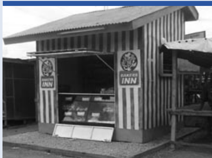
The Bakers Inn in Budunburum Refugee Camp in Ghana, just outside of Accra.

It's Not Too Late was the name of a roadside beauty shop we passed traveling from Accra to a small refugee camp in West Ghana last fall. The name had a religious connotation, as did many of the other shops of Ghanaian and refugee entrepreneurs: By God's Grace Bakery, Peace and Love Tailoring Shop, Heaven's Light Business Center and Great God of Fashion Shop. While these names sound unusual to us, they represent the